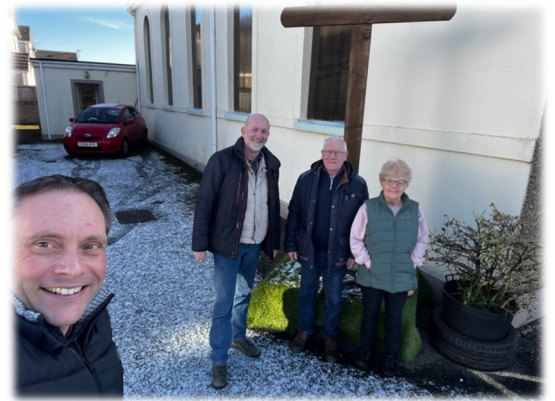
Meeting with leaders at Burry Port near Llanelli

If you have an issue you would like support with, or if you would simply value a visit from someone within the Regional Team, please do let us know. We will be delighted to arrange a suitable time.