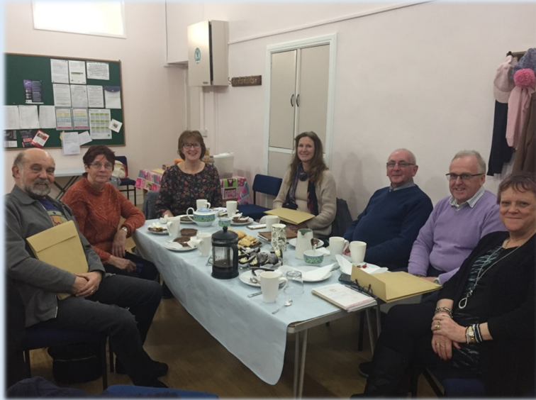
Safeguarding trainers enjoying tea together at Ebenezer Baptist Church, Neath...