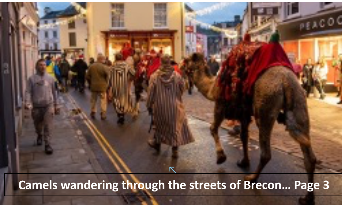
Camels wandering through the streets of Brecon... Page 3